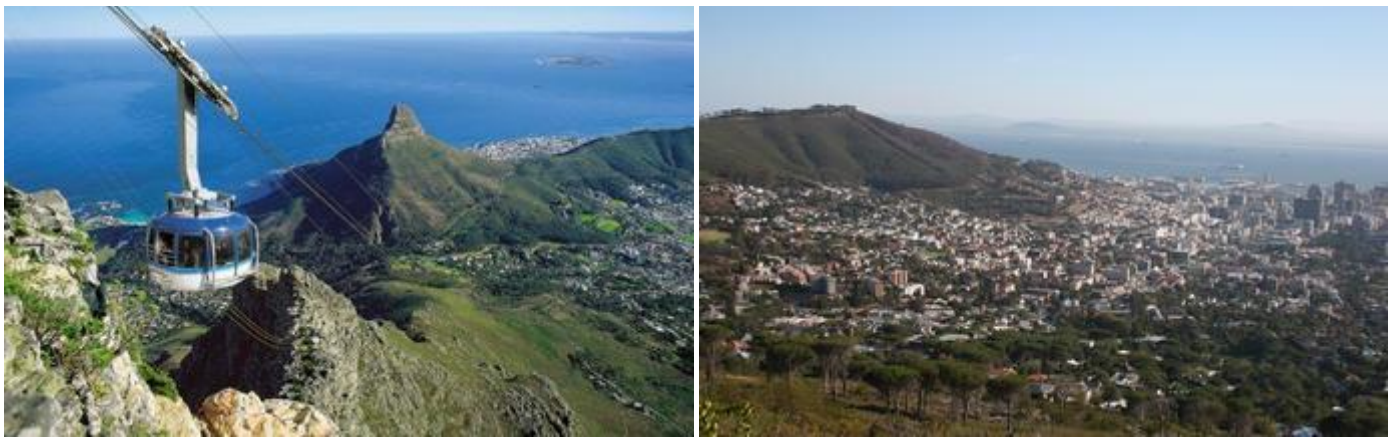
Table Mountain Cableway

On a clear day from the summit of Table Mountain you get spectacular views of the City, its Waterfront, Camps Bay, the majestic Hottentots Holland Mountains to the East and the mountains of the Cape Peninsula all the way down to Cape Point to the south. The Table Mountain cableway, a must for all visitors to the Cape, boasts revolving floors, giving passengers a 360 degree view. After descending the mountain, you will depart on a tour of the "Mother City" taking in Signal Hill – where the Noon Day Gun is fired at midday, every day except Sunday – through the colourful Bo-Kaap or Cape Malay Quarter, past the Grand Parade, City Hall and the Castle of Good Hope and South African Cultural History Museum.